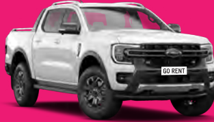
Ford Ranger Wildtrak or similar