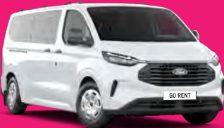
Ford Kombi Transit or similar