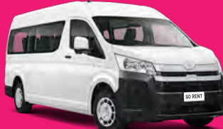
Toyota Hiace or similar