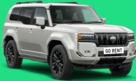
Toyota Land Cruiser Prado Hybrid or similar