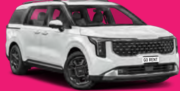
Kia Carnival or similar 5 8